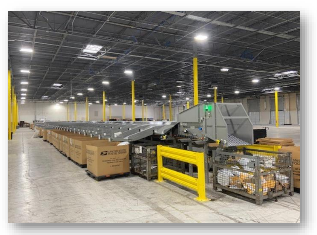
*Capacity calculated at 20 hours per day